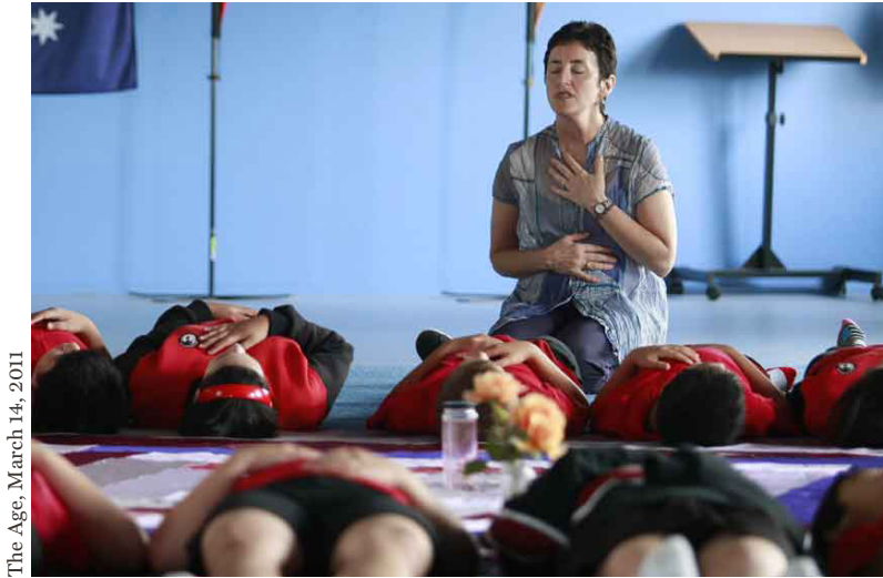
The Age, March 14, 2011